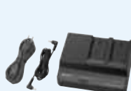
BC-U2 Battery Charger (2-slot)