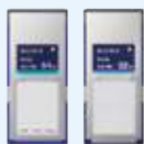
SBP-64A/32 SxS Pro Memory Card