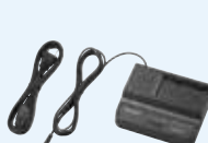
BC-U1 Battery Charger (1-slot)