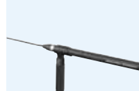
ECM-680S Stereo Microphone