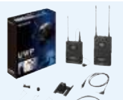
UWP-V1/V2 Wireless Microphone System