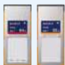
SBS-64G1A/SBS-32G1A SxS-1 Memory Card